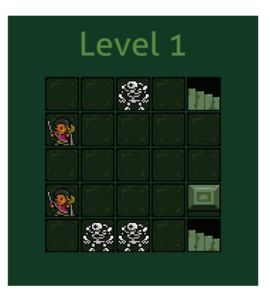
Figure 1: A screenshot of a level from Before Venturing Forth . Art by Oryx.

This means rethinking a lot of the ideas we might have about evaluation, inherited from areas like procedural generation research. A procedural generation usually is judged by how good the content it generates is. But for automated game design we must also consider how our system presents itself, how it responds to interrogation (if such a thing is even possible), how it grows over time and demonstrates this to the people who engage with it.